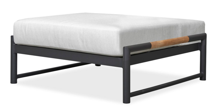
Sunbrella - Cast slate